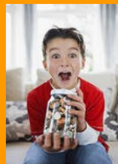
Change for "CHANGE"

Sunday 10:00AM Sunday School 11:00AM Worship/Preaching 6:00PM Worship/Preaching Every 5th Sunday 6:00 PM Youth Service Wednesday 7:00PM Worship/Preaching 7:00PM Youth Group